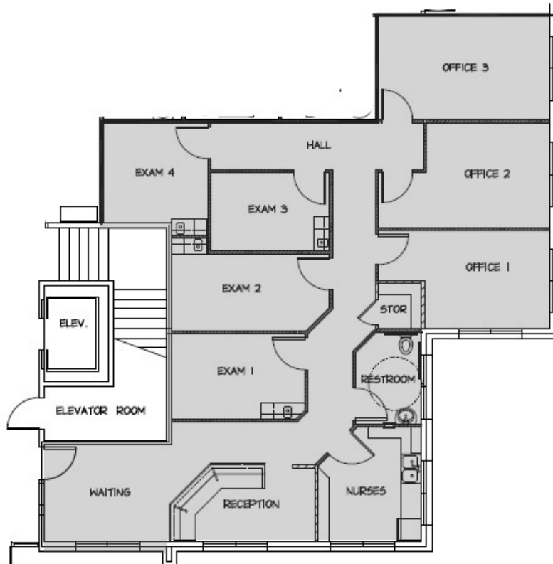
Suite 160 - 1,786 Rentable Square Feet